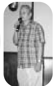
Eager contestants belting out their songs.