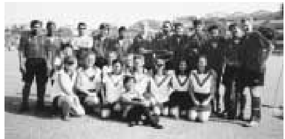
CSC Men's and Ladies' teams.