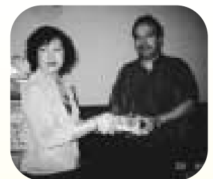
Another prize winner