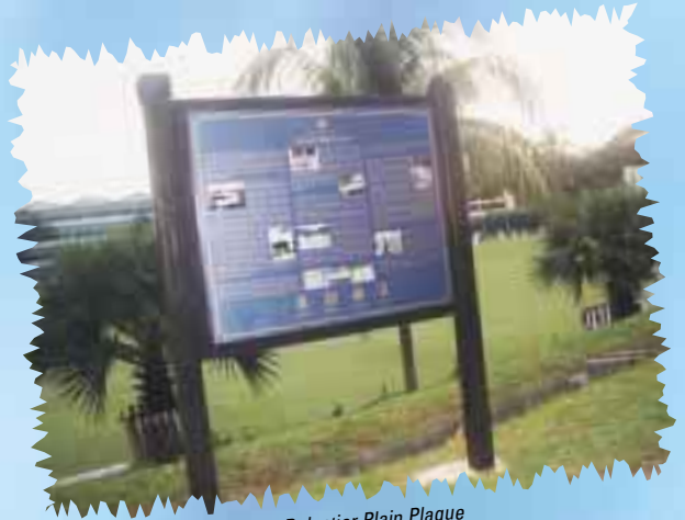
Balestier Plain Plaque