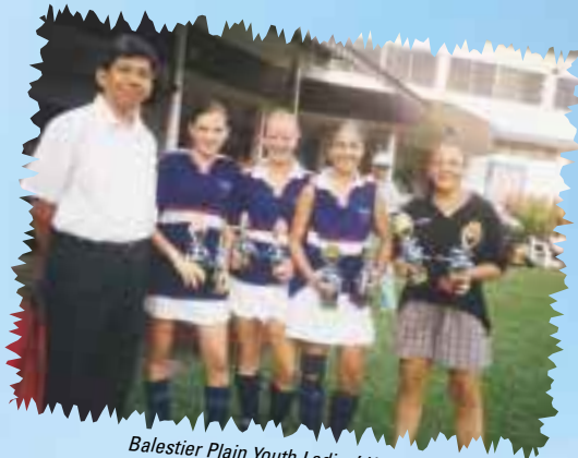
Balestier Plain Youth Ladies' Hockey Champions UWC