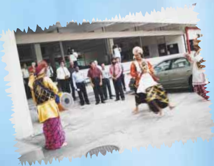
A warm reception at the S'pore Khalsa Association for Dr. Yaacob Ibrahim, Ag Minister for Community Development & Sports and Minister-in-Charge of Muslim Affairs