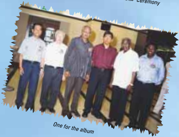
One for the album