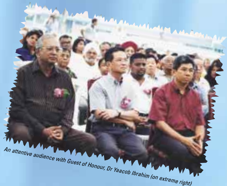
An attentive audience with Guest of Honour, Dr Yaacob Ibrahim (on extreme right)