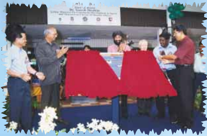
Guest of Honour, Dr Yaacob Ibrahim unveiling the plaque