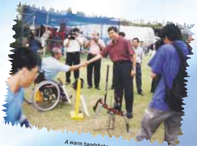
A warm handshake