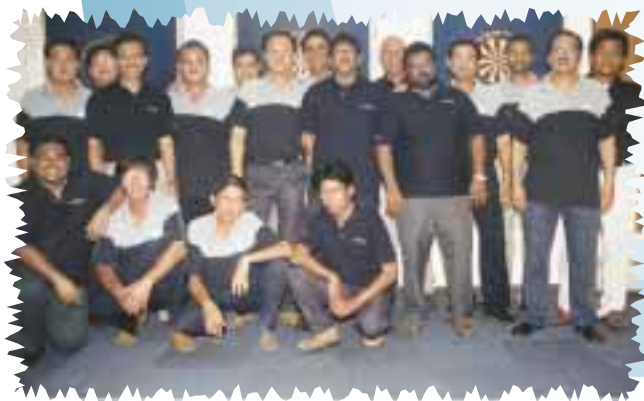
Twin Terrors of CSC 2002 - CSC Sharks (Defending Champions) - CSC Renegades (Div. 1 Runners-up) see page 8