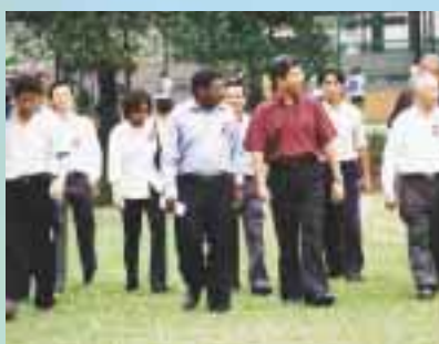
Dr Yaacob Ibrahim touring the BPC grounds along with the various BPC & NHB officials.

During his address, Dr. Yaacob Ibrahim had said, "The Heritage of the Plain is a testimony of the struggle of the early immigrants to Singapore. It tells of how in spite of difficult working conditions then, there was a vision to build social-cum-sports clubs in their new homeland."