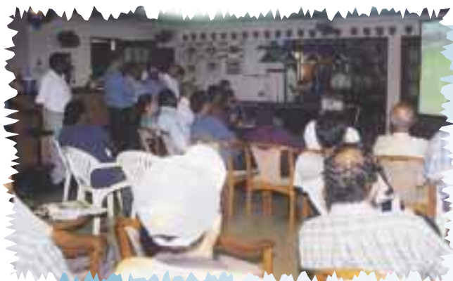
A large turnout of members watching soccer World Cup Live on big screen