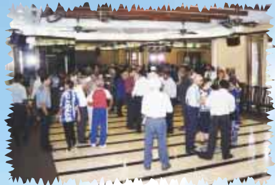
Invited Guests & Officials at Reception