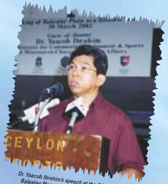
Dr. Yaacob Ibrahim's speech at the 'Marking of Balestier Plain as a Historic Site' Ceremony