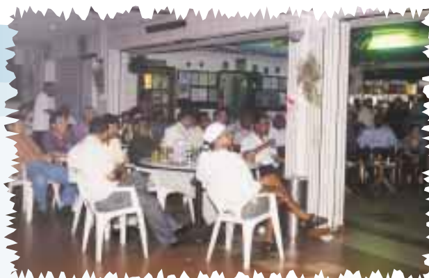
Members enjoying the Nite