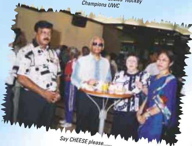
Say CHEESE please.....