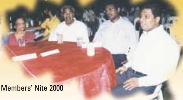
Members' Nite 2000