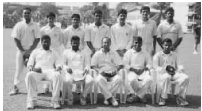
Division I Cup Champions