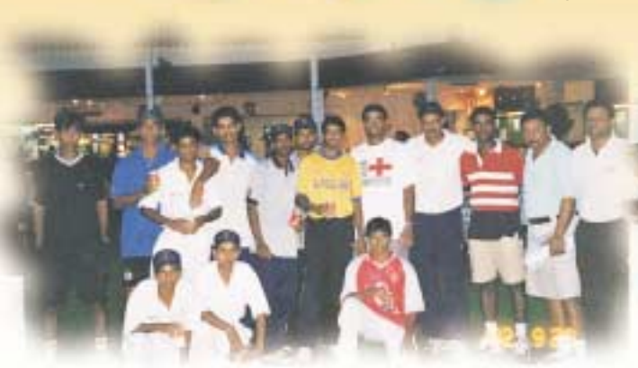
Friendly match with Student Cricket Club, Calcutta