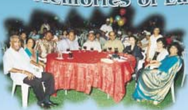
New Year's Eve 2001