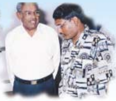
A word or two...with CSC President