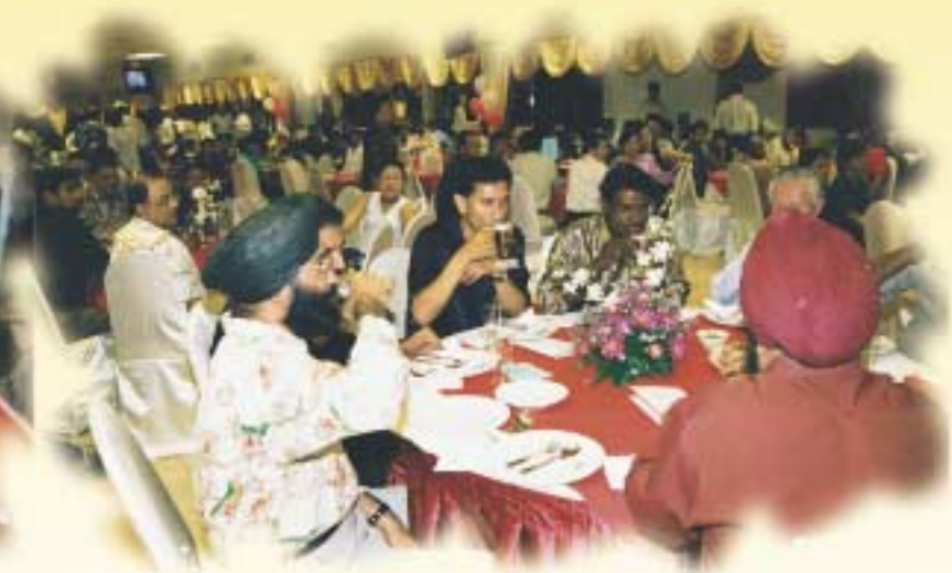
Guest-of-Honour with Balestier Plain Clubs' Presidents