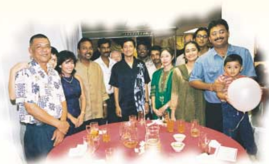
Guest-of-Honour with CSC Members & Families