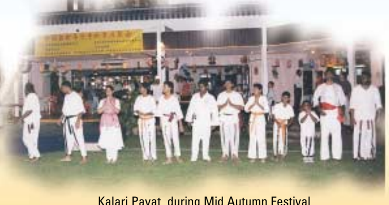
Kalari Payat during Mid Autumn Festival