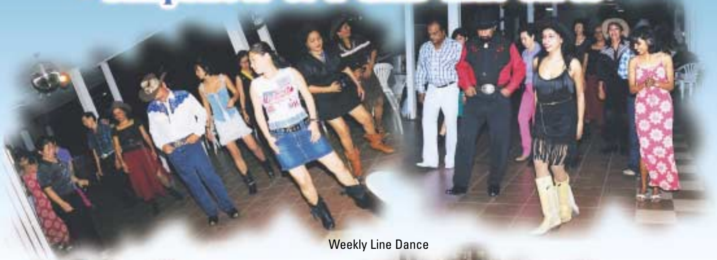
Weekly Line Dance