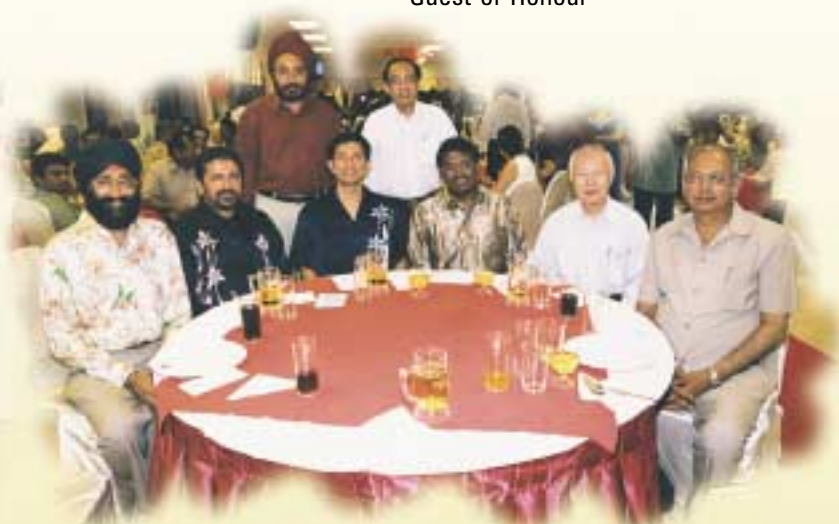
Guest-of-Honour with Balestier Plain Clubs' officials