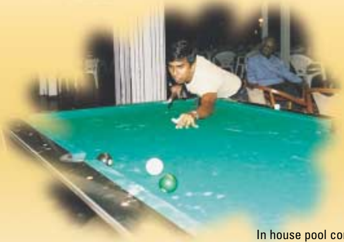
In house pool competition winner and the winning shot