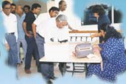
Registering for the AGM 2001