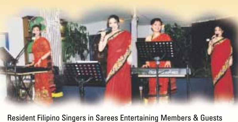
Resident Filipino Singers in Sarees Entertaining Members & Guests