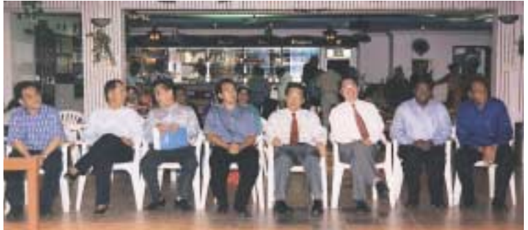
Guest-of-Honour with officials from CSC, Siau Li Martial Arts Association and MDIS