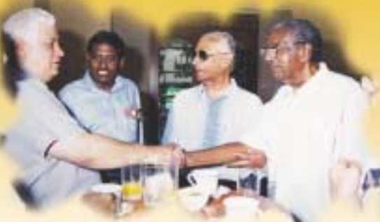
BPC Plaque Unveiling Ceremony-30 March 2002