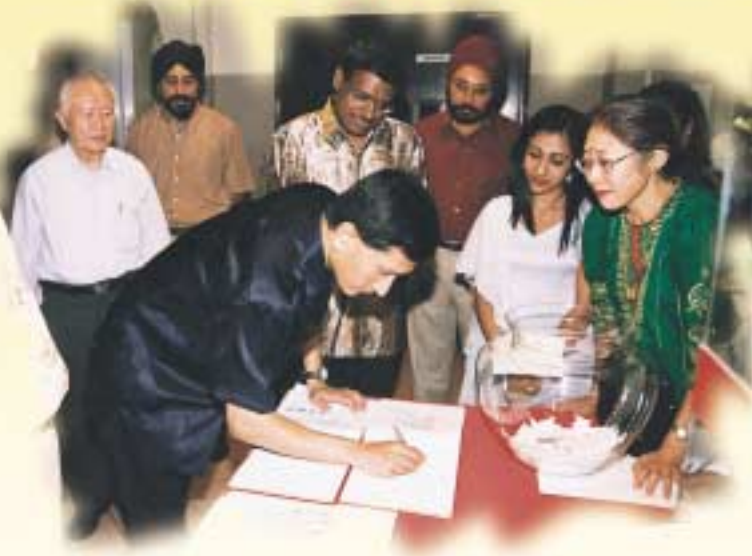
Guest-of-Honour, Dr. Vivian Balakrishnan signing the Guest Books of the BPC Clubs