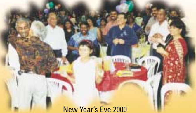
New Year's Eve 2000 with Guest-of-Honour Mr Abdullah Tarmugi