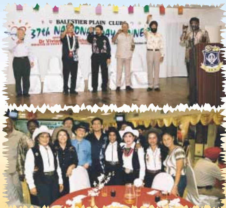
The Combined Balestier Plain National Day Celebrations - the 2nd - since last year, had a sell-out crowd of more than 400 members and guests.

It was a night of camaraderie amongst members & guests of the four Balestier plain clubs.