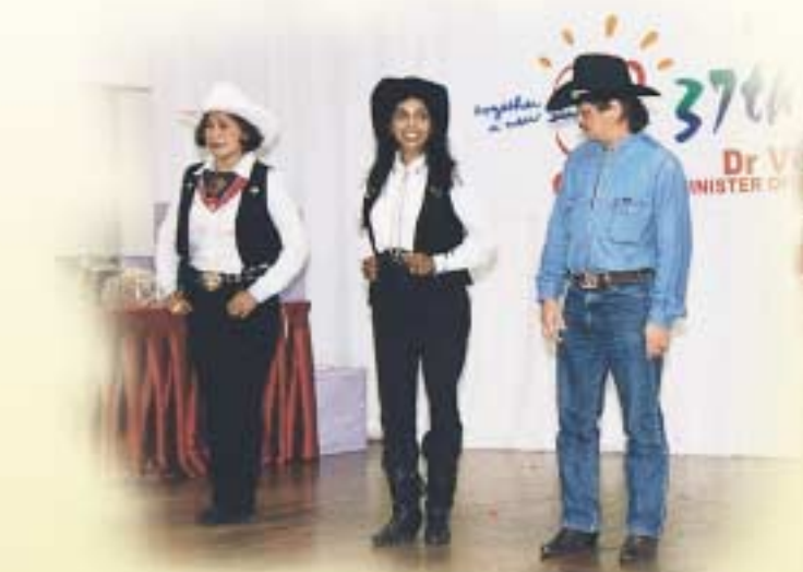
Our CSC Line Dance Group in action