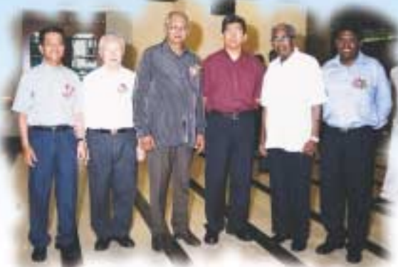
BPC Plaque Unveiling Ceremony with Guest-of-Honour Dr. Yaacob Ibrahim and Officials - 30 March, 2002